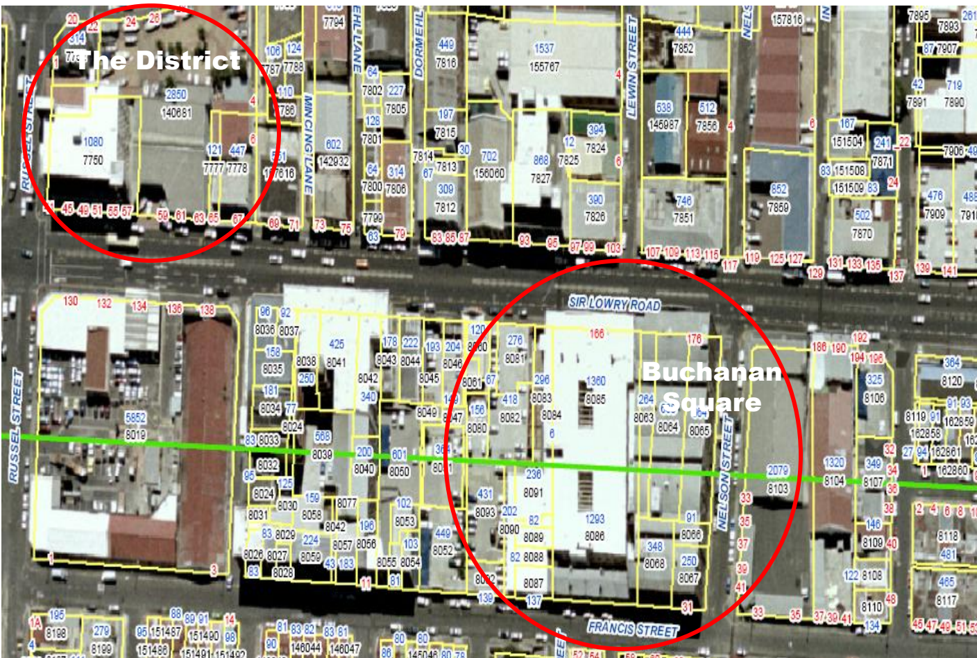
VIEWS SHOWING | Buchanan Square & top left: The District